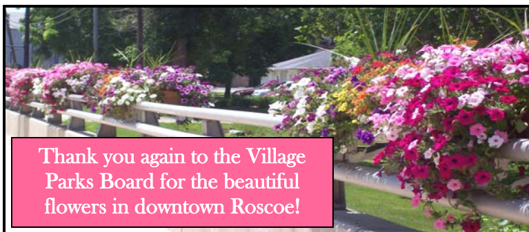
Thank you again to the Village Parks Board for the beautiful flowers in downtown Roscoe!

Make sure to shop local Chamber member businesses for reception halls, flowers, gifts, cards, cakes, jewelry, party supplies and decorations!