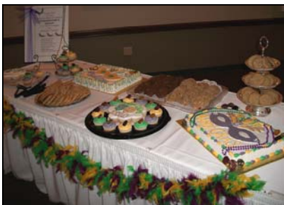
The dessert table sponsored by some of the Chamber Ambassadors